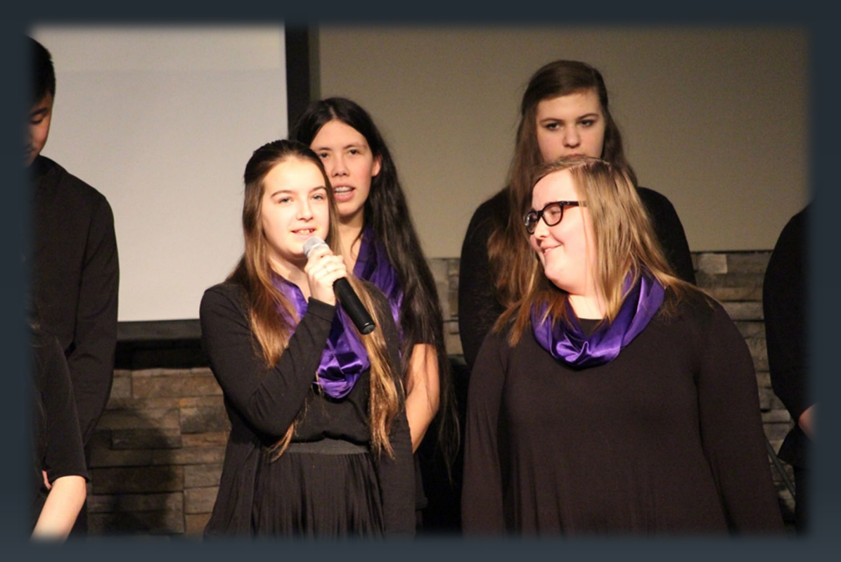
Opportunities to share with the Audience