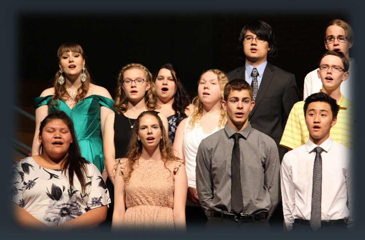
Singing at the Grad Processional Program