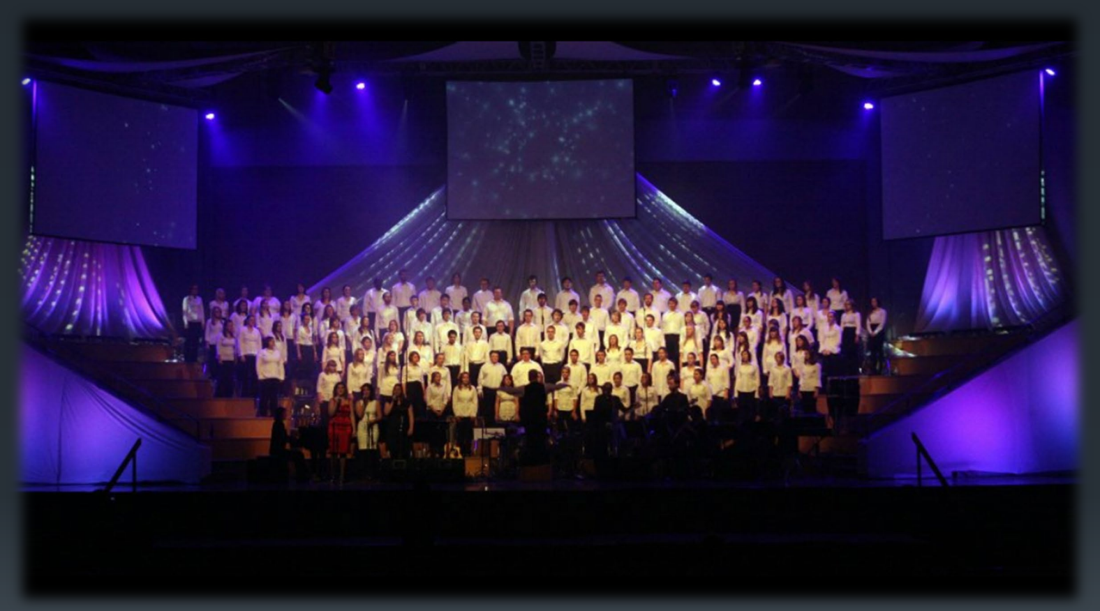
Singing in the Briercrest Christmas Production