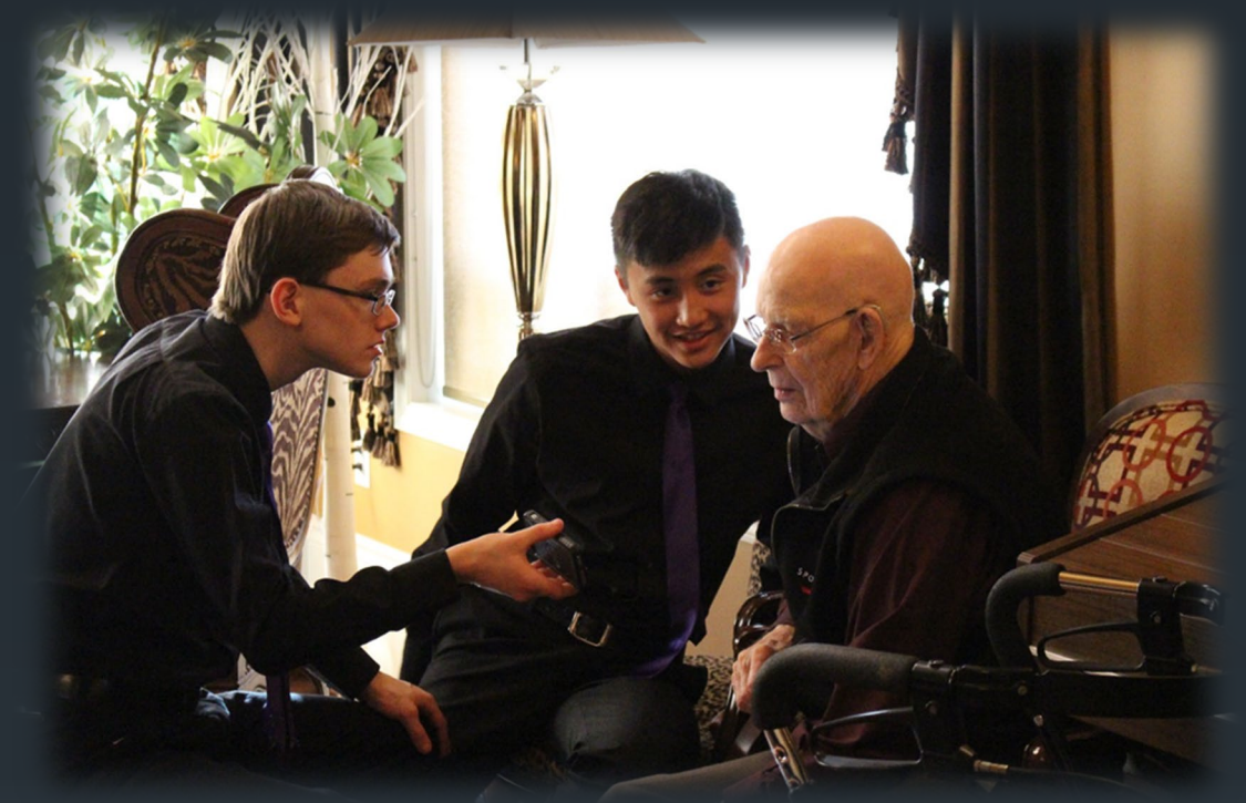
Opportunities to reach out to the Elderly