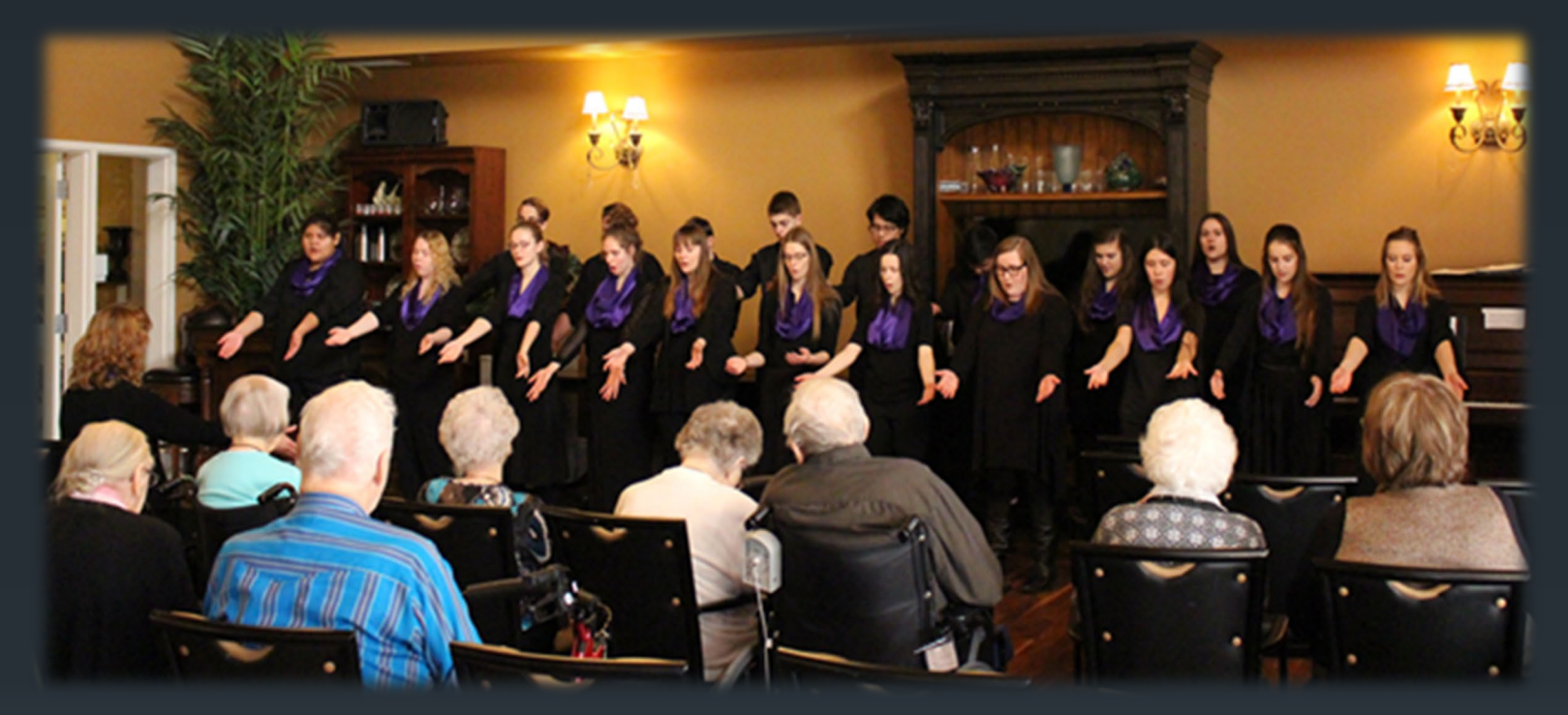
Singing at Retirement Homes and Care Centres